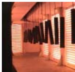
DRYING & CURING

High temperature chains need SWEPCO 722 . . .