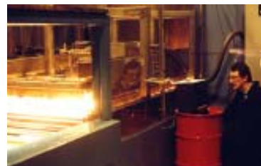
HEAT TREATING LINES

SWEPCO 722 provides clean, high performance lubrication in high temperature chain applications.